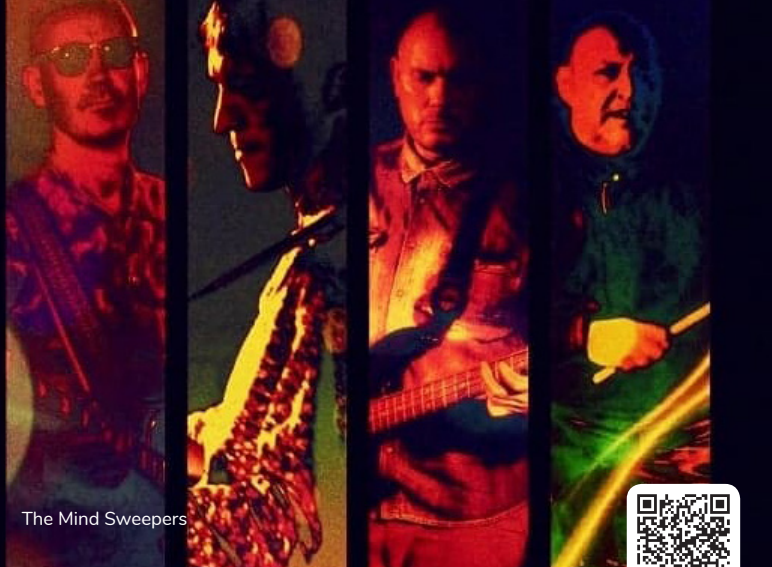
The Mind Sweepers