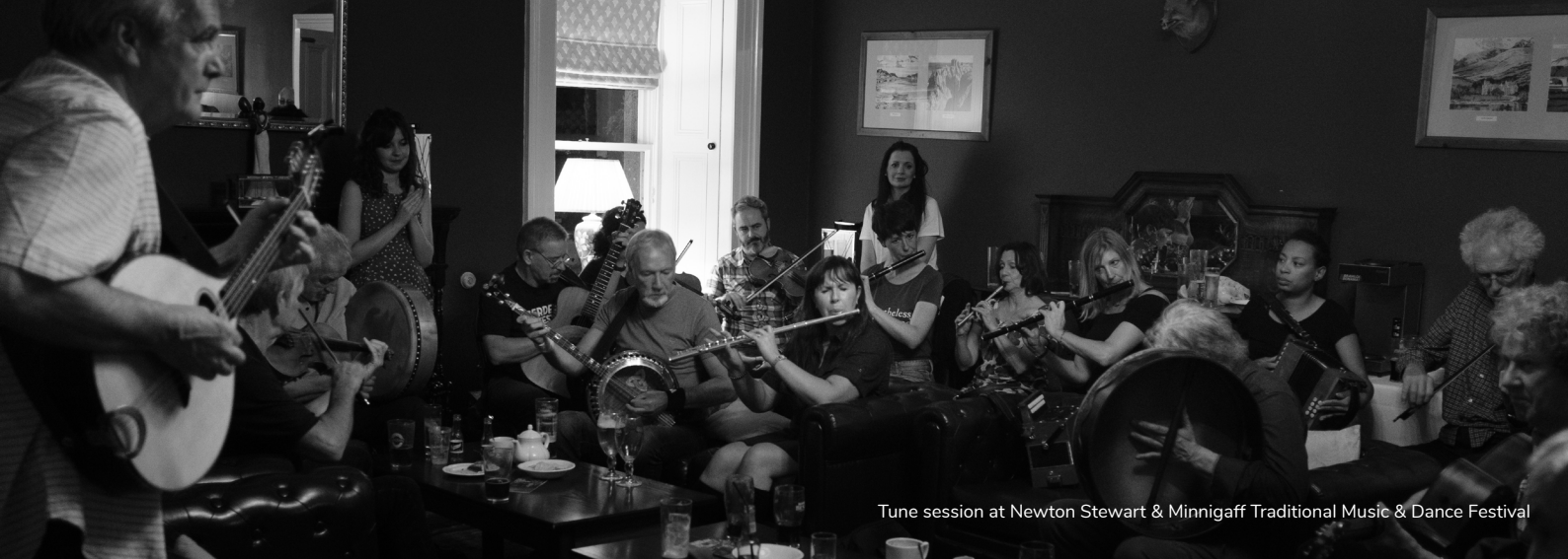
Tune session at Newton Stewart & Minnigaff Traditional Music & Dance Festival